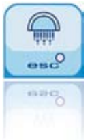
Automatic Cleaning Assistance

Save time: simply pour water and cleaning fluid into the container that comes with the WHIPPER. Then start the automatic cleaning assistance at a push of a button. No need to take the machine apart, no time-consuming cleaning.