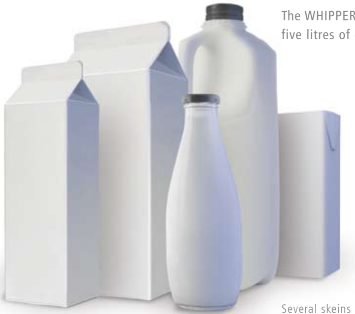
Several skeins fit directly into the unit.

The WHIPPER 5 contains a volume of five litres of cream.